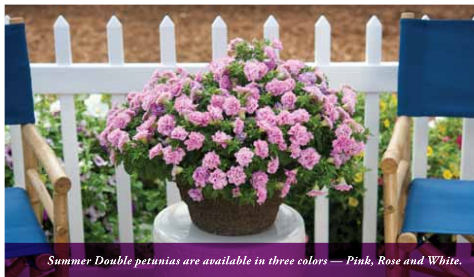
Summer Double petunias are available in three colors — Pink, Rose and White.