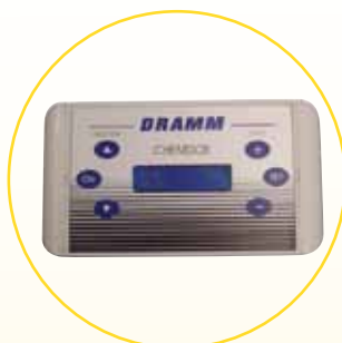
Easy to Program